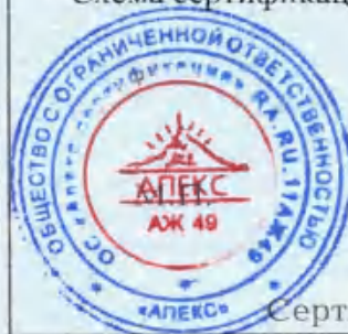
Схема сертификации: 1с.